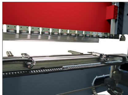
X-R-Z1-Z2 4 axis backgauge (optional)