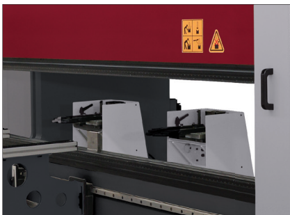
X1-X2-R1-R2-Z1-Z2 6 axis ATF type backgauge (optional)