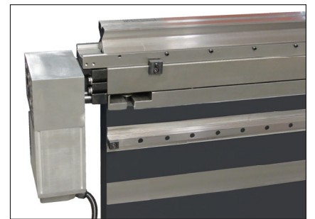
CNC table crowning system with wedges (standard)